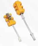
4 and 8 position Modular Adapters